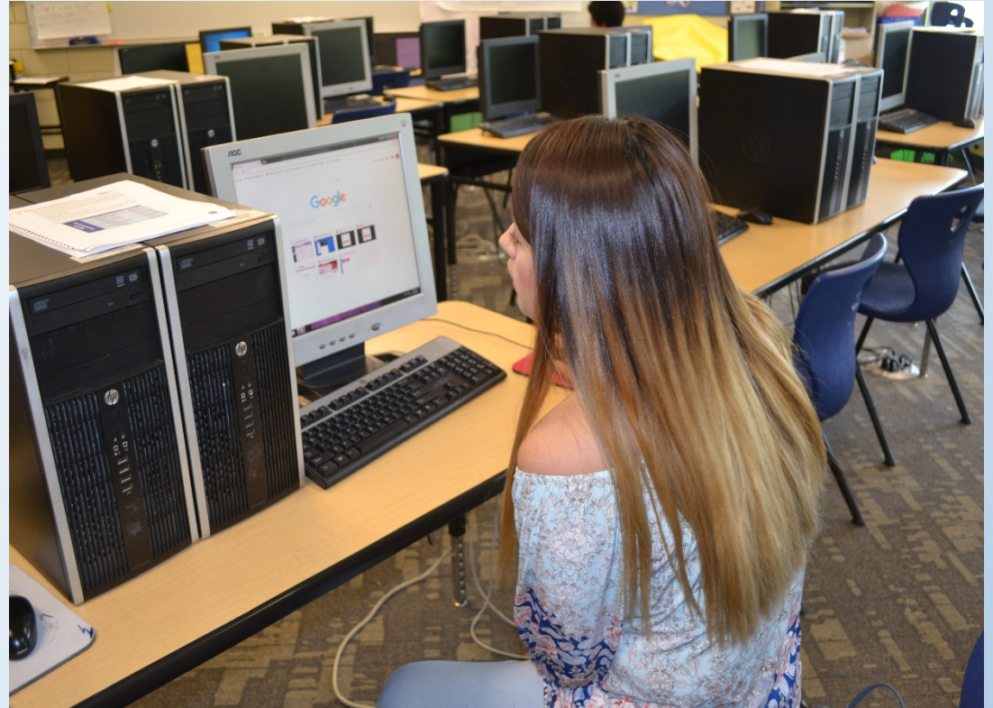
End of Junior Year