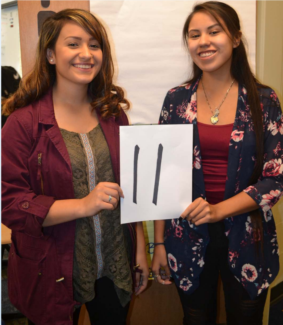
Beginning of Junior Year