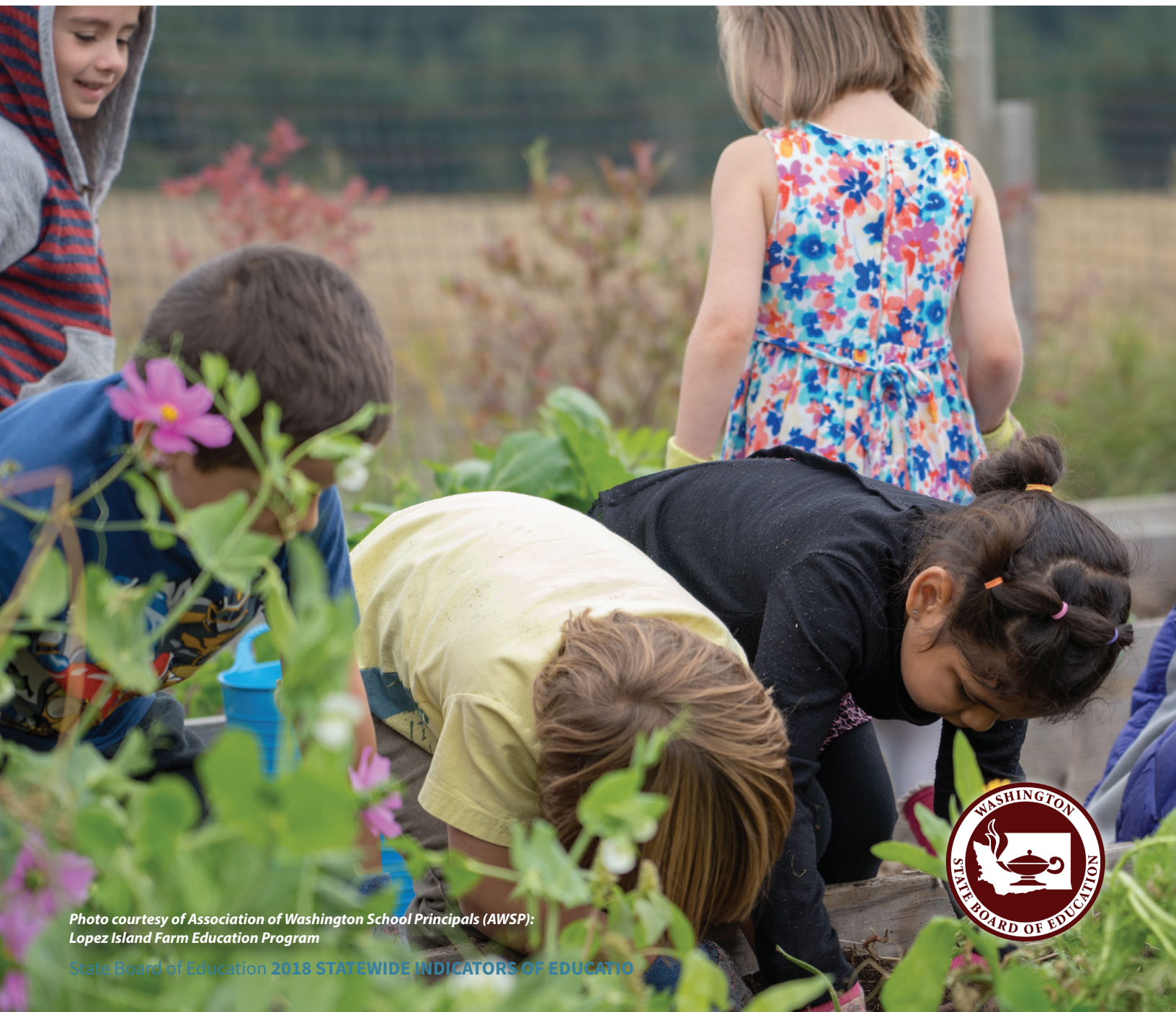
Lopez Island Farm Education Program

State Board of Education 2018 STATEWIDE INDICATORS OF EDUCATIO