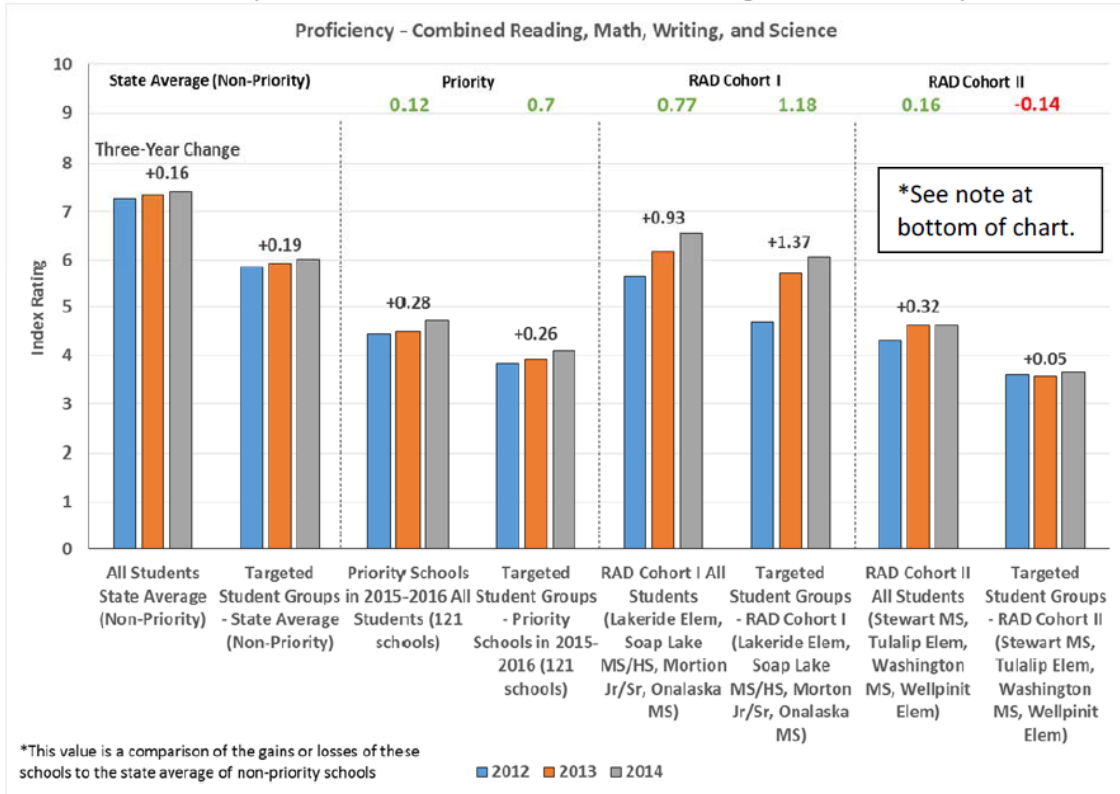
Figure 2: Performance of Priority Schools