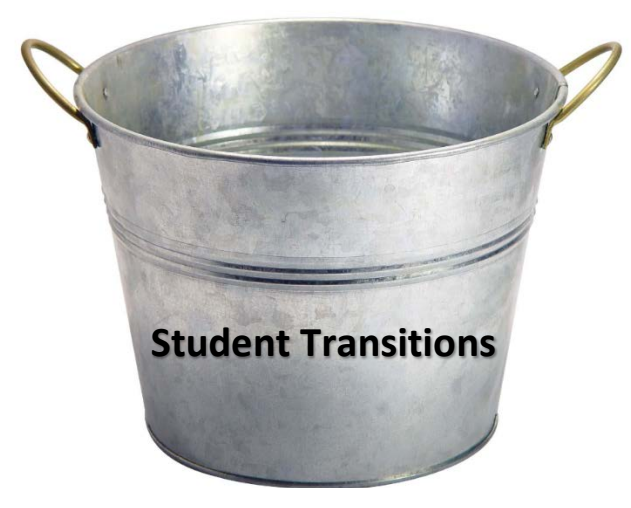
Stitching together secondary and post-secondary transitions for all students system-wide