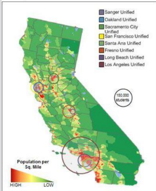
Participating Districts in CORE

Note: High >1000, Low <100 Source: California Department of Education